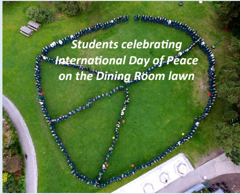
Students celebrating International Day of Peace on the Dining Room lawn