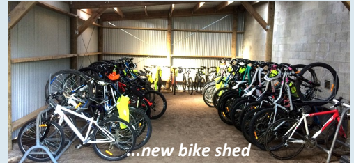
...new bike shed