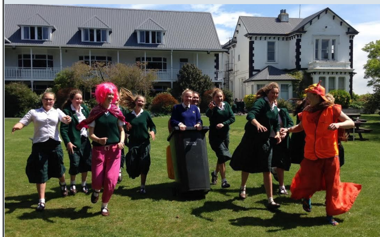
Year 13 Leaders dressed to face TBHS for a game of Touch Rugby

RENT A YEAR 13 FOR A DAY...Several Year 13 students were "auctioned" last week for use as "slaves", required to dress in unusual costumes, carry out favours and assist with tutoring for the day.