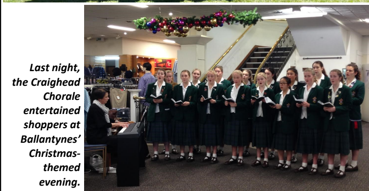
Last night, the Craighead Choral entertained shoppers at Ballantynes' Christmas-themed evening.